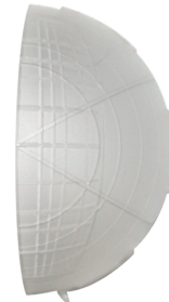
Blinds PD4 Art.No: 92313

Dimensions: Ø 200 x 90 mm Impact strength: IK09 Housing: coated steel basket