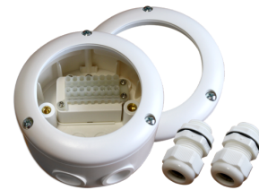
Surface mounting socket IP65 PD4-SM IP54 Art.No: 92376

Battery: 3.0 V Lithium CR2032 (inclusive) Dimensions: 57 x 35 x 7 mm Material color: -